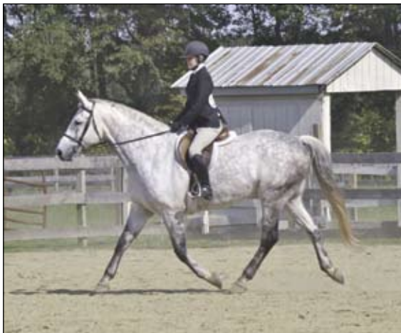
West Chester University (Pennsylvania) Equestrian Team members