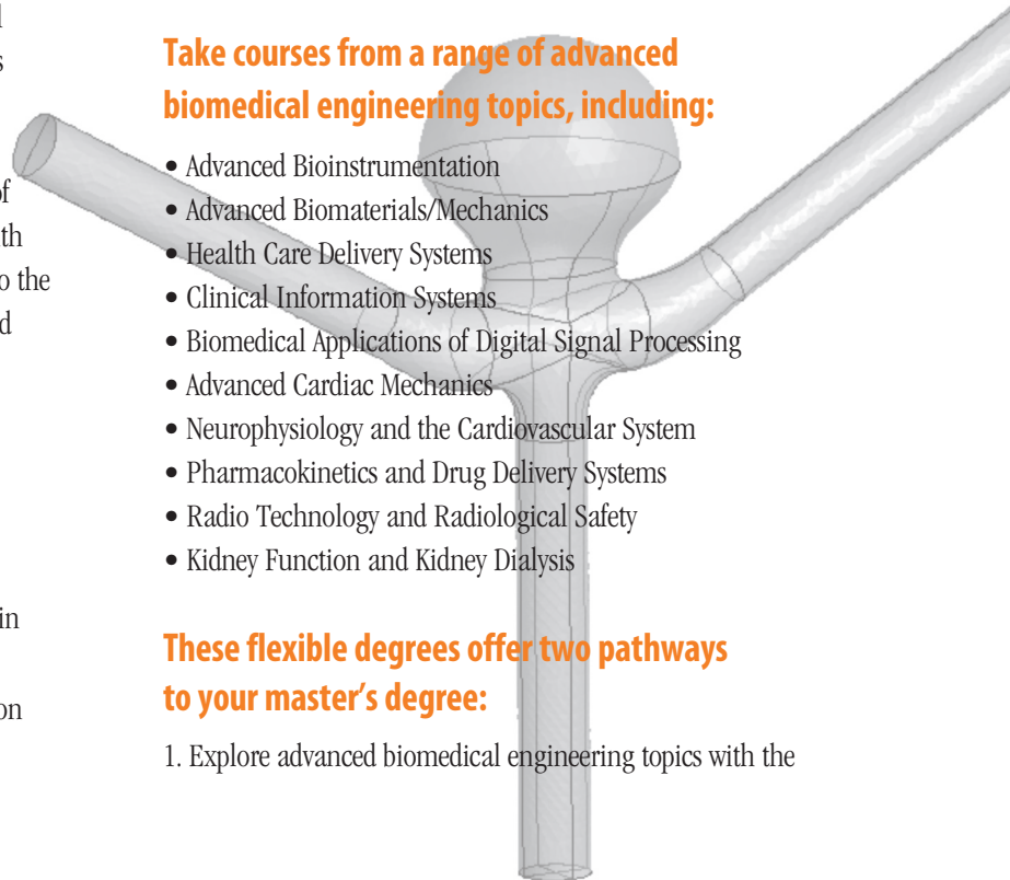
Fluid dynamics model of a cerebral aneurysm